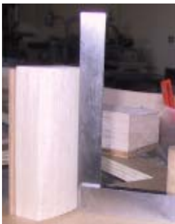
A balsa wood crush caul for a contrabass showing plywood backer (on left). A large square assures perpendicularity.

To glue ribs to blocks we usually make a wooden counterform, or caul, to match the block curve. Some time ago, we came up with the idea of making the entire caul from blocks of balsa wood commonly found in hobby and art stores. Balsa shapes easily, and the wood will compress to fit small irregularities the first time it is used. It will do the same in each